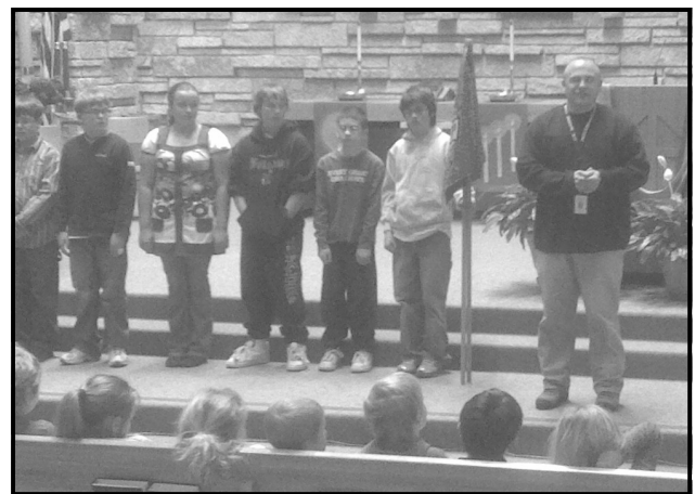
Students from the FLS Safety Patrol are installed. The FLS Safety Patrol aids in the protection of FLS Students as well as other members of the Faribault community.

We sincerely thank the committee and the Paradise Center for the Arts for this fantastic opportunity. If all goes well, we are planning with the center to make this a yearly activity.